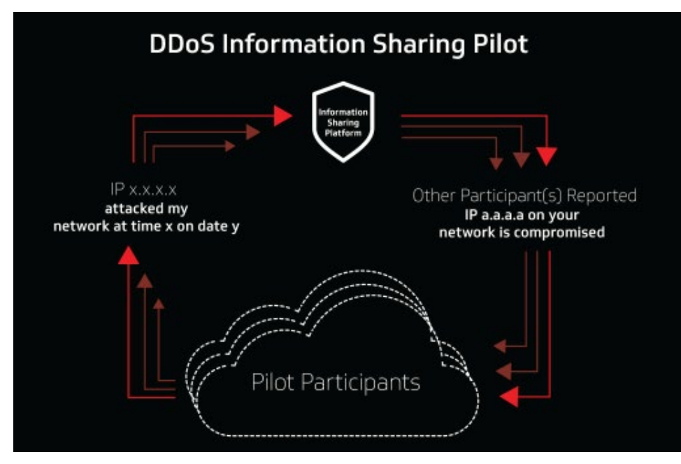
Figure 3: DDoS Information Sharing Pilot

Figure 3. To protect privacy, only non-personally identifiable information, such as the source IP address and volume of the attack, are shared.